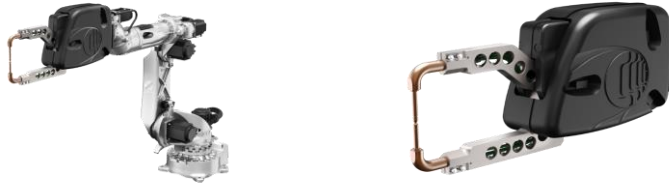
FIGURE 1 MODEL OF A COMAU ROBOT USED FOR THE WELDING OF CAR PARTS

At each piece's welding point, some welding parameters are recorded, such as current between the electrodes, resistance, number of points already welded by those electrodes and so on.